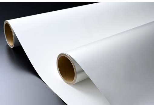
Left: Samples of SPACECOOL INC.'s radiative cooling membranes. Below: Conceptual image of the Gas Pavilion at Expo 2025 Osaka, Kansai, Japan features an exterior membrane made from SPACECOOL's radiative cooling material. Inside, visitors can experience XR (cross-reality) content about carbon neutrality.

Radiative cooling is a natural phenomenon whereby objects cool down by releasing residual heat into the surrounding environment