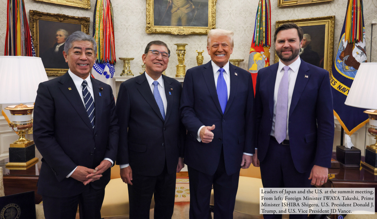
Leaders of Japan and the U.S. at the summit meeting. From left: Foreign Minister IWAYA Takeshi, Prime Minister ISHIBA Shigeru, U.S. President Donald J. Trump, and U.S. Vice President JD Vance.