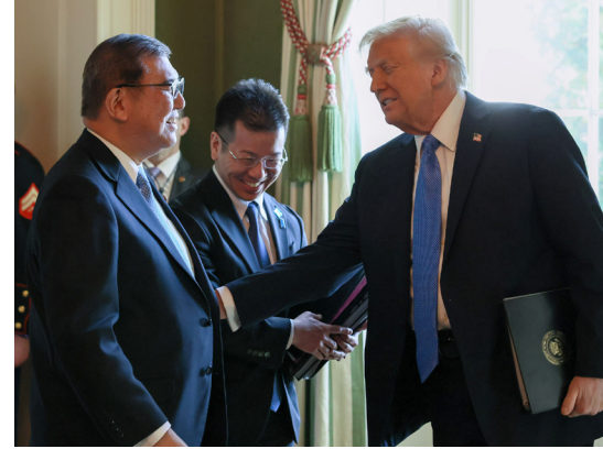
Above and right: After the summit meeting, the two leaders held a joint press conference.

Prime Minister Ishiba reiterated Japan's unwavering commitment to fundamentally reinforcing its defense capabilities and President Trump welcomed such commitment. President Trump underscored the unwavering commitment by the U.S. to the defense of Japan, using its full range of capabilities, including nuclear. The two leaders once again reaffirmed that Article V of the Japan-U.S. Treaty of Mutual Cooperation and Security applies to the Senkaku Islands. The two leaders confirmed their commitment to the steady implementation of the realignment of U.S. Forces in Japan in accordance