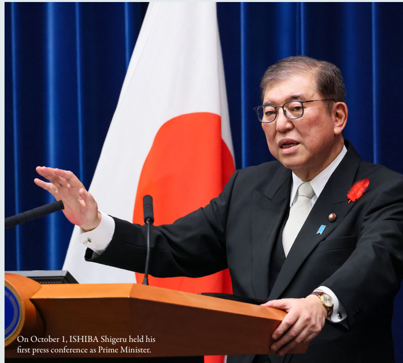
On October 1, ISHIBA Shigeru held his first press conference as Prime Minister.