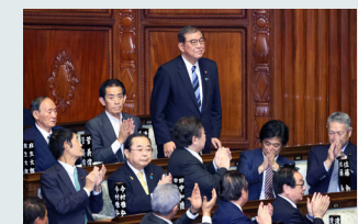
On October 1, 2024, Ishiba was appointed Prime Minister following a vote in both the House of Representatives and the House of Councillors.

In his fifth run for the LDP leadership, Ishiba was chosen as the party leader from a record nine candidates and was subsequently appointed as Prime Minister. He declared his commitment to gaining the understanding and support of the public.