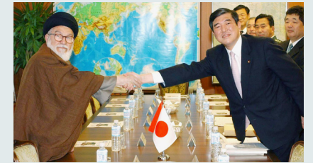
Ishiba during his visit to Iraq while serving as Director-General of the Defense Agency.

After rejoining the LDP in 1997, Ishiba entered the Cabinet for the first time in 2002 as Director-General of the Defense Agency. He worked on emergency legislation and the dispatch of the Self-Defense Forces to Iraq. He later held positions such as Minister of Defense and Minister of Agriculture, Forestry and Fisheries. He also ran in the LDP leadership elections in 2008 and 2012.