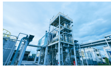
The world's first microwave chemical mass production plant was completed in 2014.

Chemical products that are essential in today's manufacturing require huge amounts of energy to produce. Now, an ambitious new startup company, Microwave Chemical Co., Ltd., has built the world's first chemical mass production plant that uses microwaves, leading the way in the green transformation (GX) of the chemical industry.