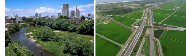
Left: Sendai—the host city of the World BOSAI Forum—is rich in greenery, with a population of 1.09 million in Miyagi Prefecture. The city has been frequently afflicted throughout its history by natural disasters, from typhoons to floods and tsunami.