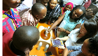
Midwives receive training for fetal ultrasonic examinations.