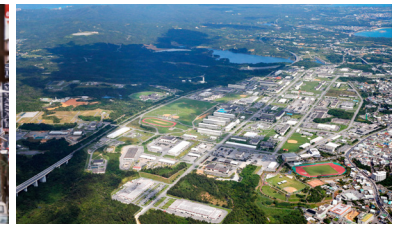
Left: The signing ceremony for the Okinawa Reversion Agreement in June 1971. It was carried out simultaneously in Tokyo and Washington, D.C., and was broadcast live via satellite. Center: Okinawa on May 15, 1972, the day of its reversion to Japan. Displayed above the road is a banner celebrating the occasion. Under U.S. administrative control and for a while thereafter, cars drove on the right side of the road, but from 1978 onward they switched to the left in accordance with national traffic rules. Changing everything from traffic signals to signs and road markings was an enormous undertaking. Right: There are 31 USFJ facilities and areas in Okinawa Prefecture alone, including Camp Hansen.

reversion. From 2000, the islands focused on further building up their tourism resources, including their inscription on the World Heritage List, aiming at attracting visitors from overseas. As a result, as many as 18 air routes from other parts of Asia were established, and the number of travelers exceeded 10 million in fiscal 2018.