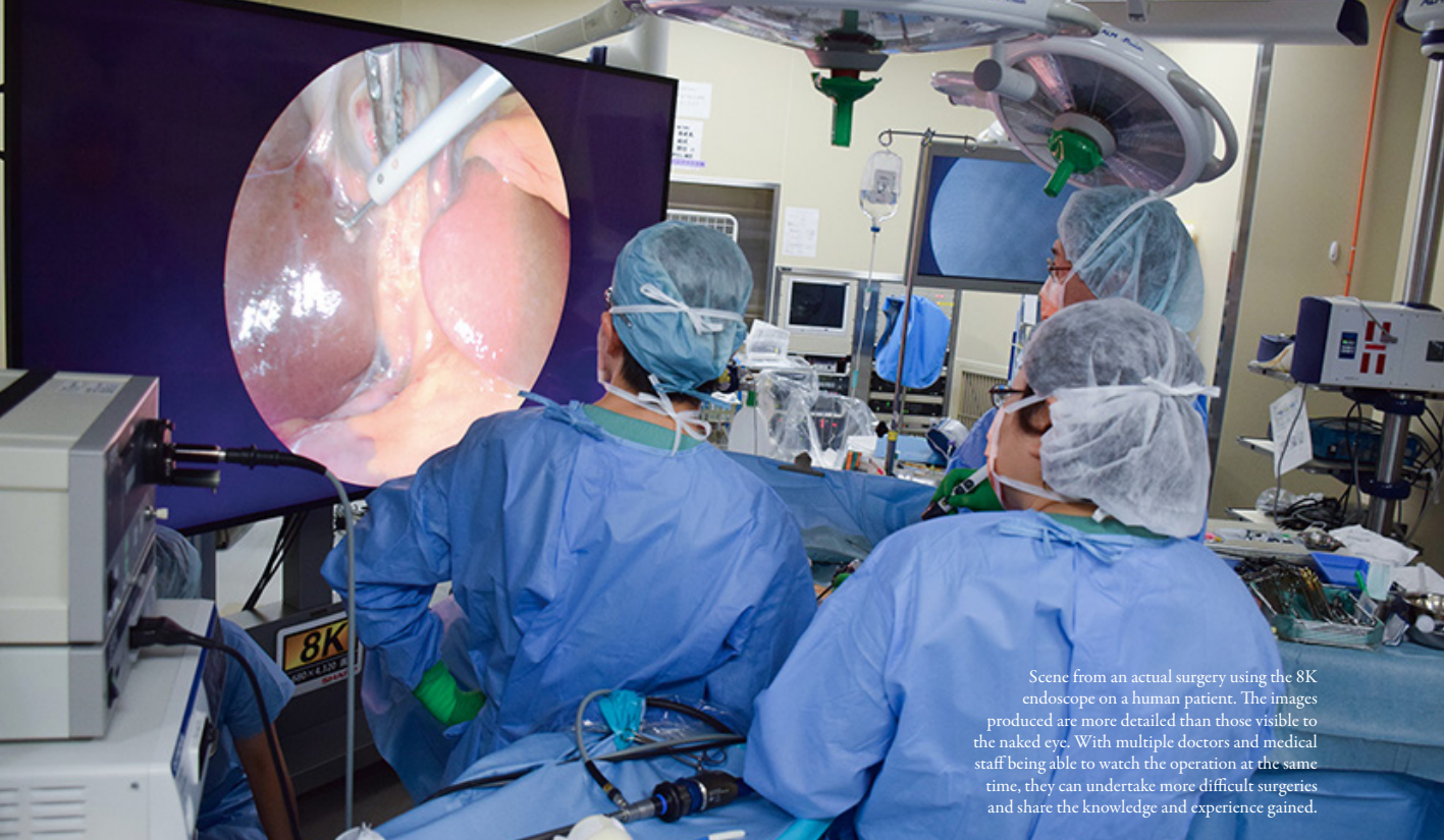
Scene from an actual surgery using the 8K endoscope on a human patient. The images produced are more detailed than those visible to the naked eye. With multiple doctors and medical staff being able to watch the operation at the same time, they can undertake more difficult surgeries and share the knowledge and experience gained.