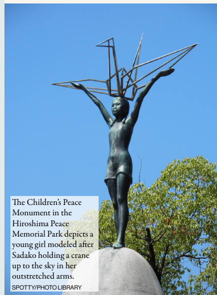
The Children's Peace Monument in the Hiroshima Peace Memorial Park depicts a young girl modeled after Sadako holding a crane up to the sky in her outstretched arms.