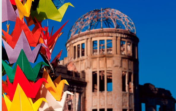
The Atomic Bomb Dome received the full force of the blast as it lay just around 160 meters from the bomb's epicenter. Despite most of the building's interior having burnt down, its outer structure has been preserved almost intact, appearing as it was immediately after the bomb exploded. The Hiroshima Peace Memorial Park, where this World Cultural Heritage site is located, is adorned throughout with paper cranes, which are considered symbols of peace.

through encouraging visits to Hiroshima and Nagasaki by international leaders and others.