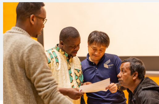
Top: Nippon Sport Science University provided wide-ranging assistance, from athlete scouting and instruction to coaching-staff development, as well as nutritional and psychological support for athletes.