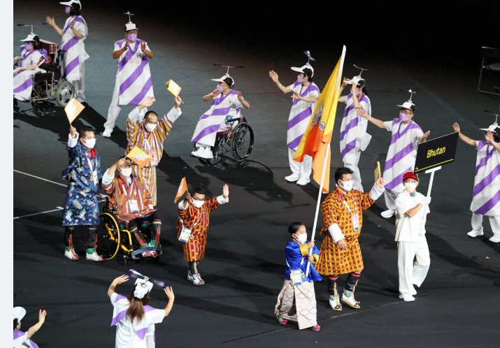
With aid from Nippon Sport Science University, Bhutan made its first Paralympic appearance and sent a delegation wearing ethnic costumes to the Opening Ceremony. The country’s three para-athletes competed in the shot put and archery athletics events.

provides a wide range of assistance tailored to each country’s situation. Its support has reached a total of 43 countries, six of which made their first-ever Paralympic appearances this year: Paraguay, Bhutan, the Maldives, Grenada, Saint Vincent and the Grenadines, and Guyana.