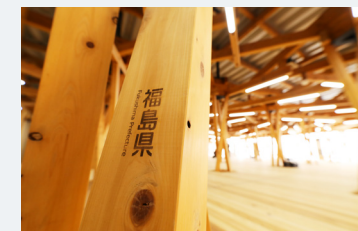
The aroma and warmth of wood fills the air around the Village Plaza at the Olympic and Paralympic Village. This wood collected from across Japan will greet the athletes before and after their competitions. The Village Plaza is one of the facilities that symbolizes the sustainability concept of the Games.

Innovative efforts to create a sustainable society will be found throughout the Olympic and Paralympic Games Tokyo 2020. They present an excellent opportunity for people in Japan and around the world to become instilled with the mindset of sustainability. The huge summer events that will lead society to a more innovative future are almost here.