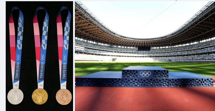
The medals (left) and the podium prepared for the Games of the XXXII Olympiad. The fact that these remarkable symbols of Tokyo 2020 are made from recycled materials will likely linger in people's memories as a significant legacy of the Games.

Furthermore, no less than 24.5 tons of used plastic was collected from the public to construct the