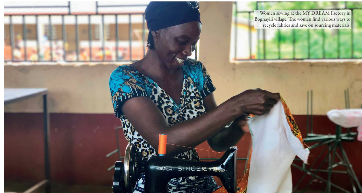
Women sewing at the MY DREAM Factory in Bognayili village. The women find various ways to recycle fabrics and save on sourcing materials.

you coming to the village." When that day arrives, we can certainly treat it as the achievement of one of the Sustainable Development Goals (SDGs).