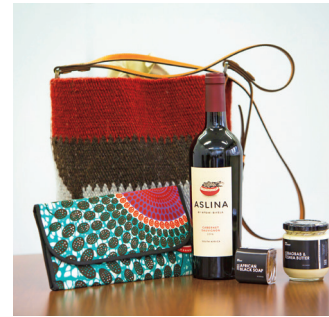
Part of Proudly from Africa's fine selection of fashion items and cosmetics.

garments and bags from African Print. By selling products with true appeal and quality rather than charity items, the mindset of Bognayili villagers has gradually changed.