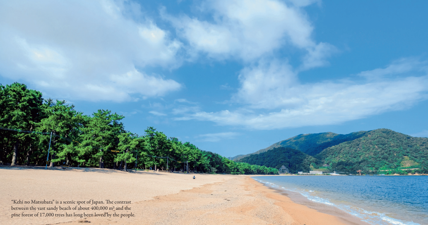
“Kehi no Matsubara” is a scenic spot of Japan. The contrast between the vast sandy beach of about 400,000 m 2 and the pine forest of 17,000 trees has long been loved by the people.