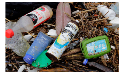
A large quantity of plastic waste with labels in other languages washes ashore in Tsuruga Bay, where the environment is influenced by the Sea of Japan’s currents.