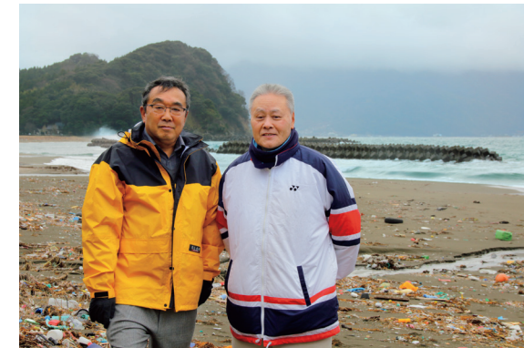
For many years, local residents have been working to preserve their beaches.

In recent years, however, this beautiful bay has been plagued by marine debris. Because of the way the deep bay brings in water from the Sea of Japan, it produces high waves in winter that carry an especially large amount of trash. The amount of trash washing up onto the bay’s east side, in particular, has grown at an alarming rate. Meanwhile, much of the dramatic increase in plastic waste over the past decade has been originating from other nearby countries. In the fiscal year ending in March 2021, over 400 m 3 of plastic trash will be processed in the city of Tsuruga.