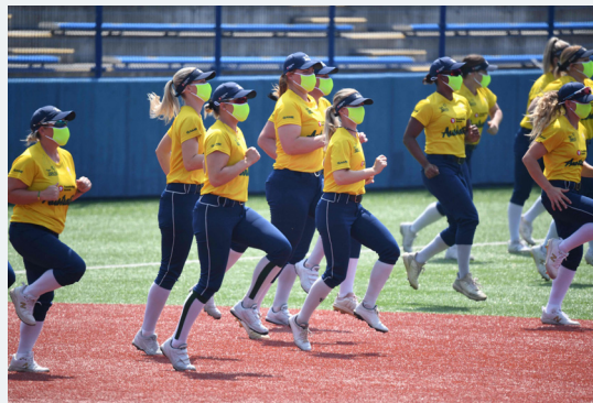
The Australian women’s softball team was the first group of overseas athletes to arrive in Japan.

Under the guidance of the World Health Organization and scientific experts, Olympic officials have come together to formulate safety measures, known as the “Playbooks,” representing the culmination of the efforts of all those involved in realizing Games that are safe and secure. The Playbooks for each group of stakeholders contain specific rules for the safety and health of all the participants and host-country