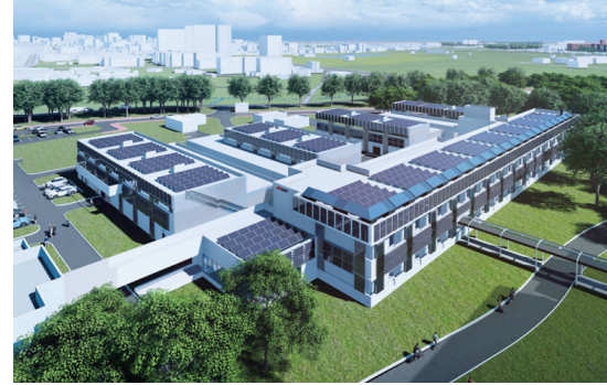
The GZR's new research facilities, slated for completion in March 2021, will become a center of Japanese innovation in the field of the environment and energy technologies.

The key to achieving this ambitious goal is to further roll out innovative technologies, so Japan will encourage accelerated research and development toward realizing the utilization of such technologies. The Global Zero Emission Research Center (GZR), established by the National Institute of Advanced Industrial Science and Technology in January 2020, will play a