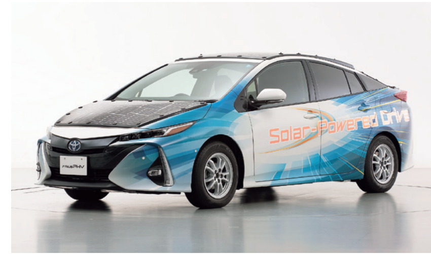
Multi-junction solar cells, which can generate power more efficiently, are expected to be applied in vehicles and elsewhere.

research topics at the GZR is next-generation solar cells, the technology for which Japan has been a leader in terms of research and development. For example, Japan has enabled the production of ultra-lightweight solar panels by using a thin film made from perovskite, a new material. In addition, the GZR has been developing multi-junction (tandem) solar cells consisting of layered materials, which boast vastly better conversion efficiency than conventional cells, allowing for more power generation in a smaller space. If those technologies are made feasible, they would facilitate installation in locations where placing conventional