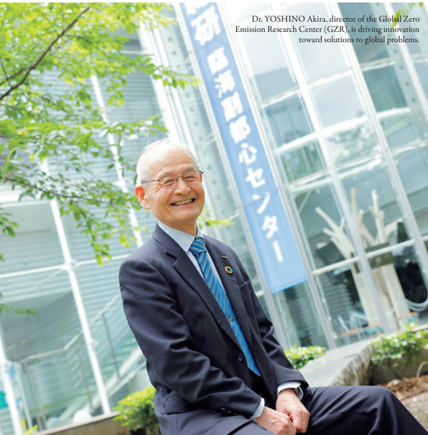
Dr. YOSHINO Akira, director of the Global Zero Emission Research Center (GZR), is driving innovation toward solutions to global problems.

Japan will forge ahead with innovative research and development to solve global environmental problems.